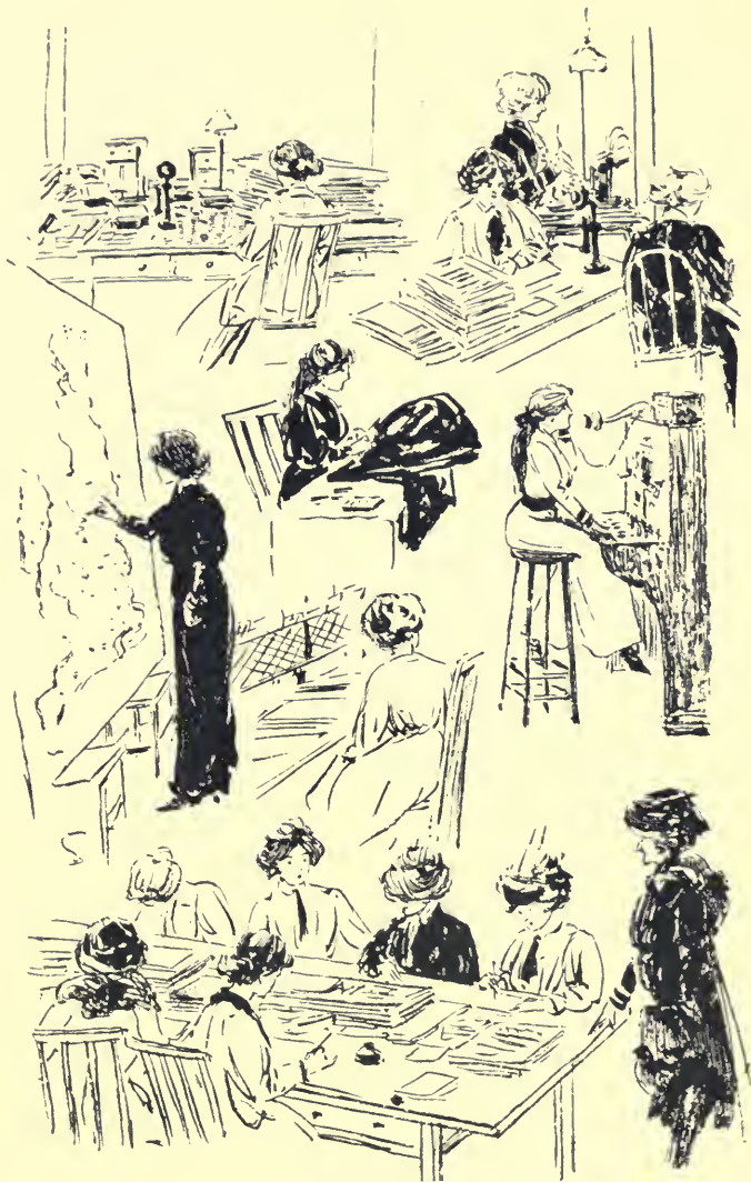
at Clement's Inn